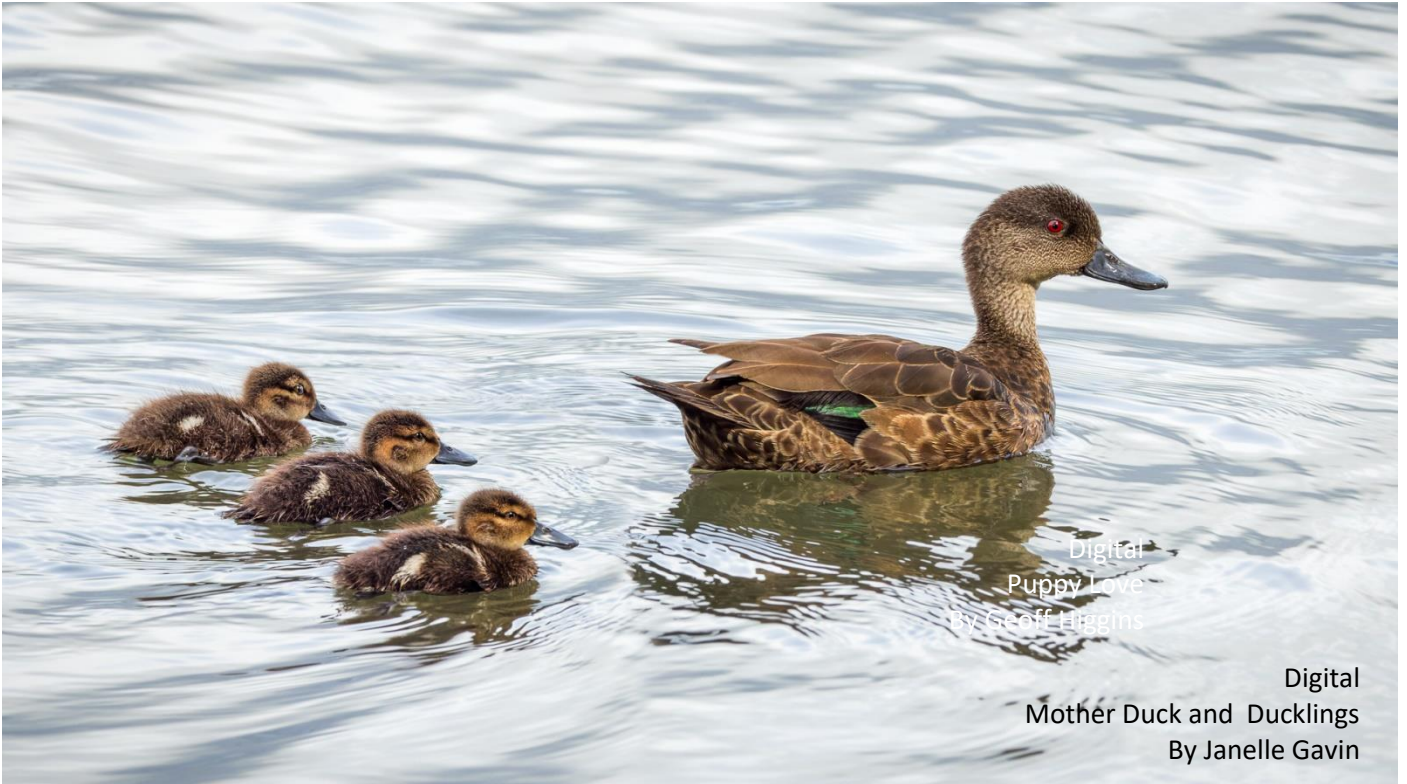
Digital Puppy Love By Geoff Higgins