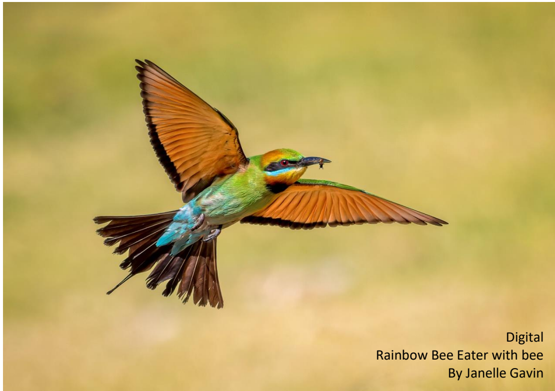
Digital Rainbow Bee Eater with bee By Janelle Gavin